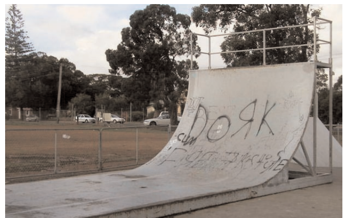
■ ABOVE: The big mother. BELOW: Skate ramps for sale.