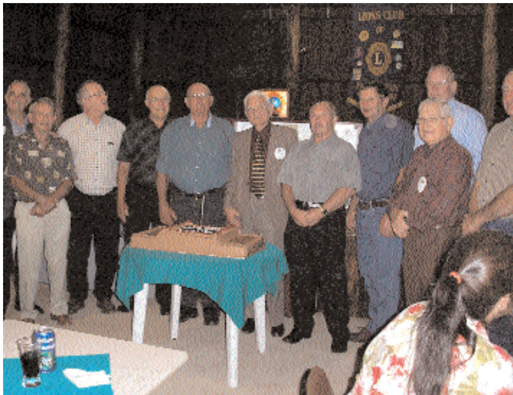
■ Boddington Lions charter members joined together for a commemorative picture at the Club's 30th anniversary dinner. Unfortunately not all are Lions today.