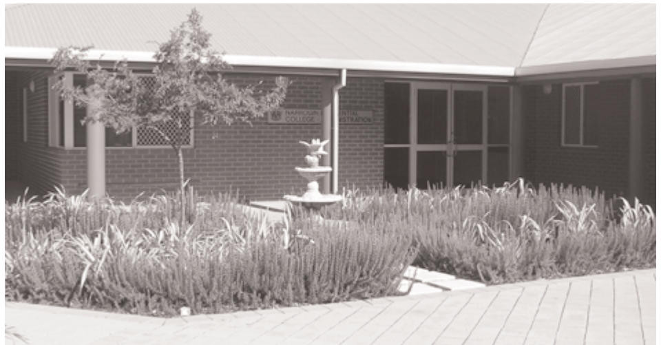
■ GRAND ENTRANCE: Pictured above is the entrance to the Narrogin Residential College and the 2007 Convention.

"The Cabaret is well under control with the music booked. The theme is 60's and 70's music and we would like everyone to dress for the period. I am sure that we all have something that will be suitable. I would like to see as many